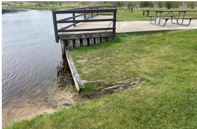
Non-Accessible Route Along The Water