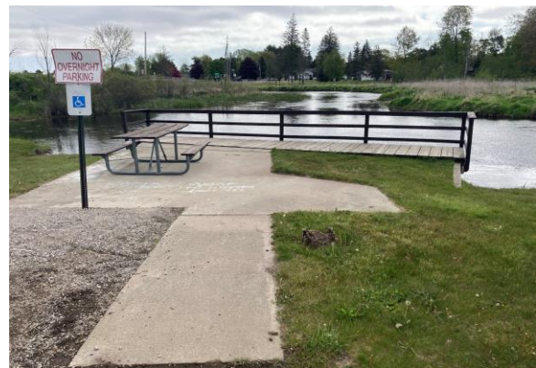
Access To Fishing Pier