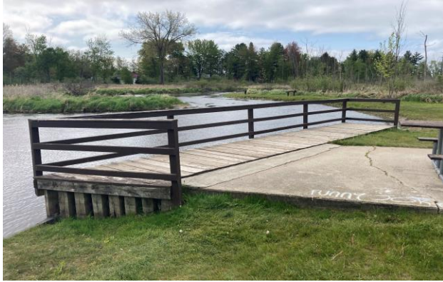
Handrail Does Not Meet ADA Standards