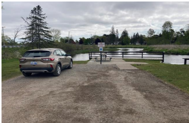
Accessible Parking Space