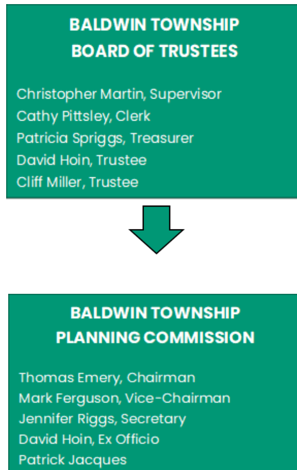
Figure 2 Baldwin Township Administrative Structure

Currently, the Township maintains two properties: the fishing pier on Nunn Road and the access point on Tawas Bay. Maintenance is limited to occasional trash and brush removal. The Township Board also has the power to purchase property, designate funds for parks and recreation area improvements and maintenance and other capital improvements within the Township with input from the Planning Commission.