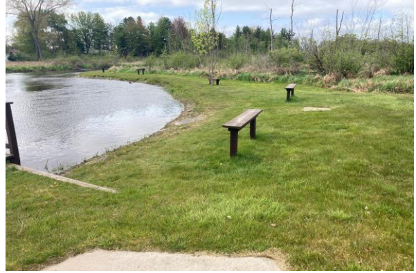
No Accessible Route To The Benches